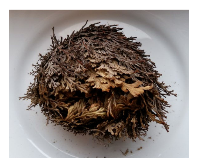
The first drops of waters

The rose opens slowly, in the following photos you can see 2 steps of opening: