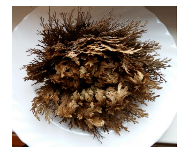
After 35 minutes sprinkled with water